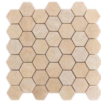
Travertine 2"x2" Hex