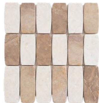
White Capuccino 2"x4" Oval