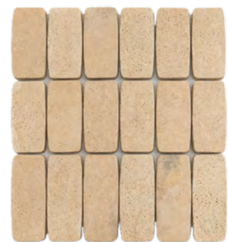
Travertine 2"x4" Oval