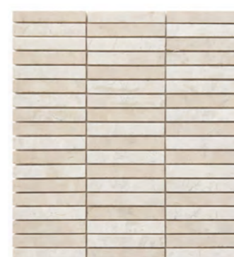
White Capuccino Stacked