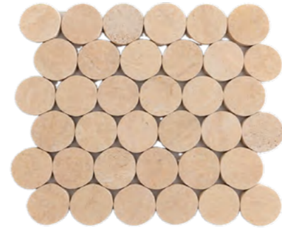
Travertine 2"x2" Penny Round